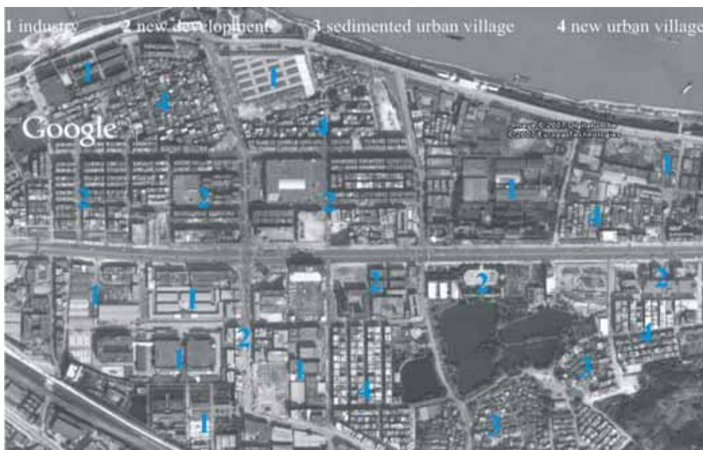
Fig. 3 fragmentation of built fabric ( early phase of urbanization, 60 km north of Shenzhen)

In the early phase of unprecedented and bold development, the city was an agglomeration of primary and secondary functions. New urban fabric was growing uncontrollably which resulted in fragmentation of space. Industrial area next to new dwelling area next to village next to industrial area (Fig. 3). There was no apparent logic in spatial order of the city. The main driving forces of economy and capital could be rivalled only by even more ominous persistence of communistic legacy (Fig. 2), especially the affiliation to demonstrate and propagate the notion of progress and forward thinking through visual image of the city. This building of identity through architectural means (a skill of the Chinese culture) dictated big boulevards, grand vistas and un-human scale of open space, ending in soaring housing towers (now built by the developers instead of the Red Party) (Fig. 4).