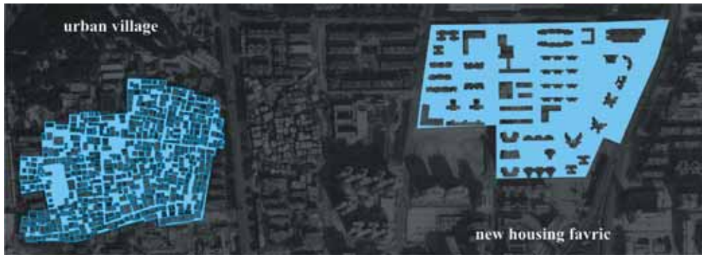
Fig. 9 open space quality: organization in urban village and new housing fabric

Urban Village is the only historically sedimented artifact in the whole urban landscape of Shenzhen. They grew out of original fishing and farming villages. These villages, formed in time, were evolved out of human needs thus made in human scale (Fig. 9). The open space was intricately connected and interwoven, where small allies led to internal courtyards that led to main streets and squares (Fig. 10). The street grid persisted and new extrusions were grafted onto. Although the housing units are quite high and the FAR ratio is even higher, the human scale of the villages is still a positive quality as opposed to the grand design ideologies of the “official” part of Shenzhen (Fig. 11).