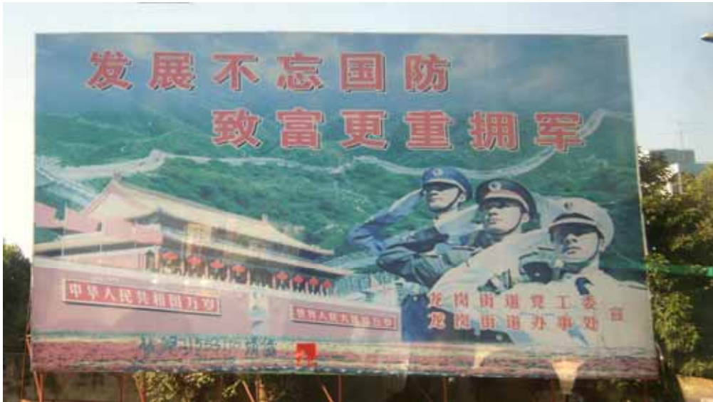
Fig. 2 still present ideological propaganda

In the early phase of unprecedented and bold development, the city was an agglomeration of primary and secondary functions. New urban fabric was growing uncontrollably which resulted in fragmentation of space. Industrial area next to new dwelling area next to village next to industrial area (Fig. 3). There was no apparent logic in spatial order of the city. The main driving forces of economy and capital could be rivalled only by even more ominous persistence of communistic legacy (Fig. 2), especially the affiliation to demonstrate and propagate the notion of progress and forward thinking through visual image of the city. This building of identity through architectural means (a skill of the Chinese culture) dictated big boulevards, grand vistas and un-human scale of open space, ending in soaring housing towers (now built by the developers instead of the Red Party) (Fig. 4).