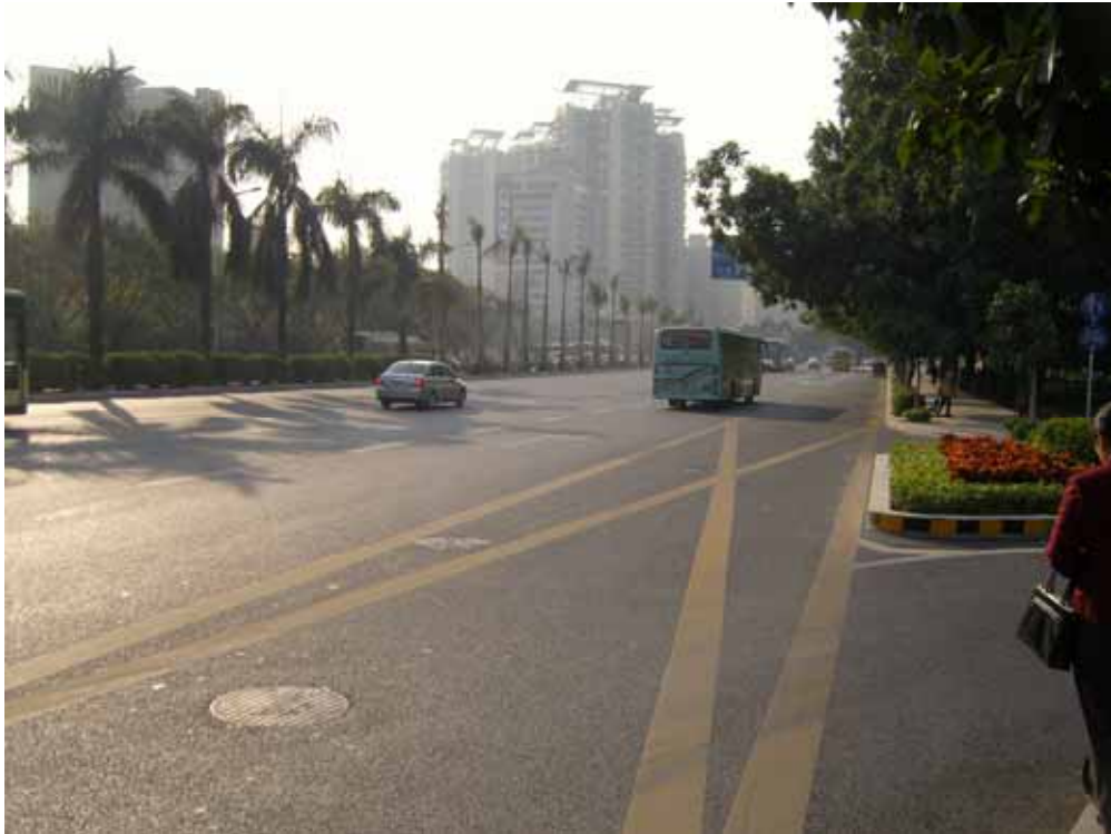
Fig. 4 new city image; big boulevards and developer's housing towers

This raises a question whether it is possible to call it a city as it was perceived as an industrial powerhouse which translates in China, in a country with a long tradition of thinking in absolute terms, into a place for work – industry, and a place to rest – dwelling. Another problem was that virtually all of the new population were former farmers that came from China's hinterland in search of prosperity and a better life, thus bringing with them customs and ways of life appropriate for a village. So not only was the physical structure of the city new, but also the social structure resembled more that of a village than that of a city. New social structures had yet to emerge.