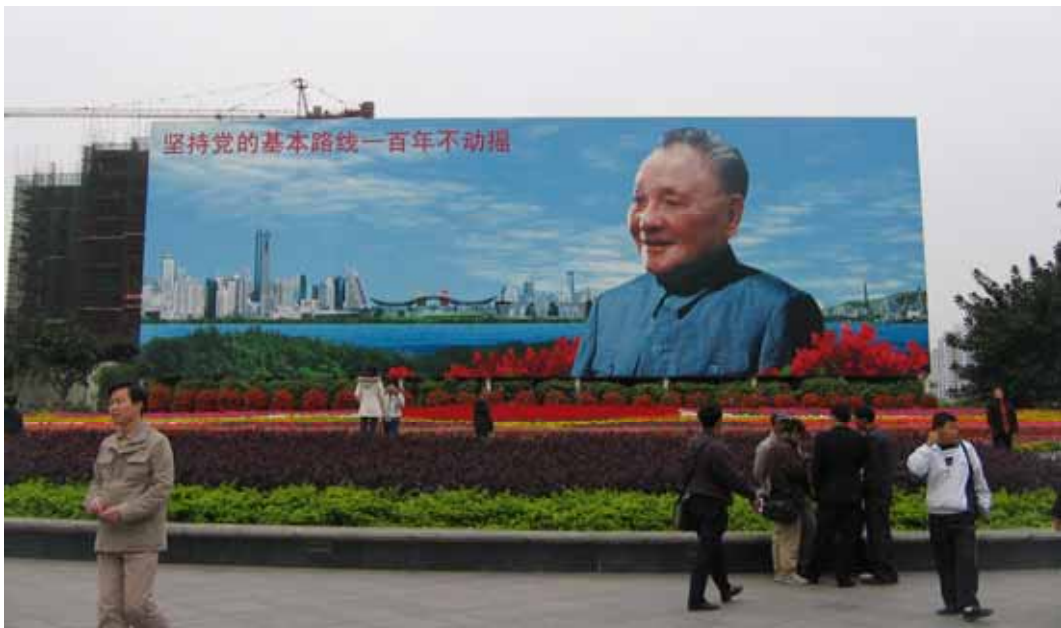
Fig. 1 Deng Xiaoping on one of the “advertisements” for building a new Shenzhen

Explaining the story of Shenzhen, one gets immediately trapped in bivalency. Should it be portrayed as an unprecedented success or as a disaster bound to happen? However the argument is bent, the facts remain: