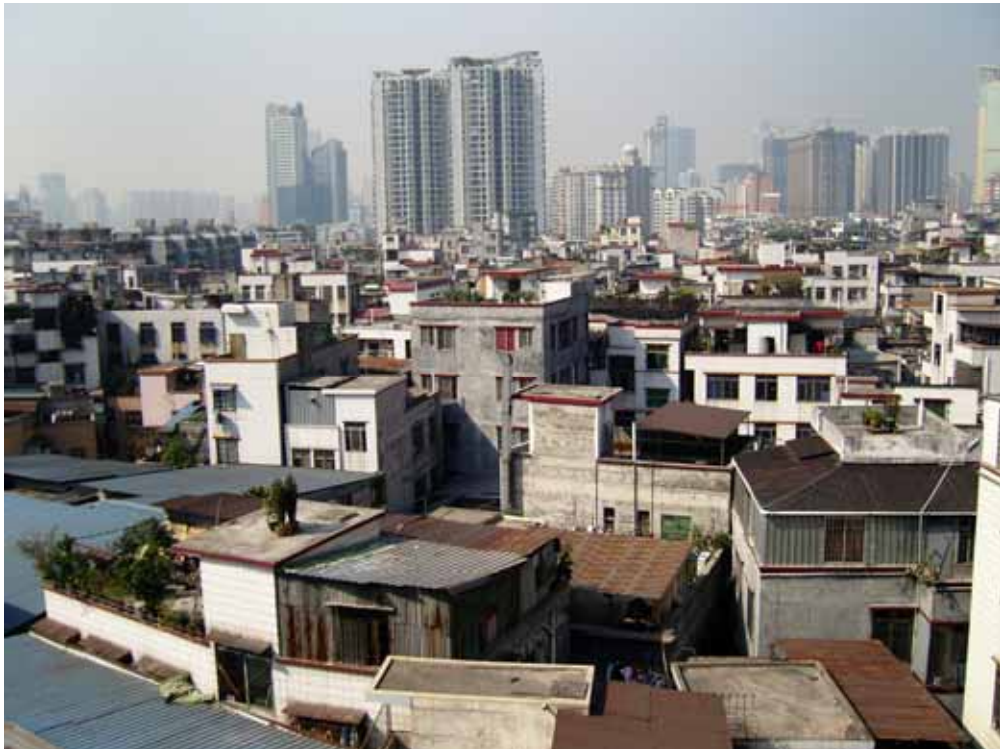
Fig. 8 urban village encompassed by new housing developments

As a historically sedimented entity, the urban village needs some further attention. When SEZ "happened" the agricultural land that the farmers had was taken from them. As compensation they were allowed to build up their village and make their income by letting out the newly acquired space. The original fabric of village was quite rapidly replaced by six to nine story extrusions usually only few meters away of each other (Fig. 8). Government turned a blind eye to the uncontrolled urbanization process that violated all building codes. It was a status quo on the basis of compensation for lost agricultural land. As it was private property, the villagers had total jurisdiction and even had their own law enforcement officers.