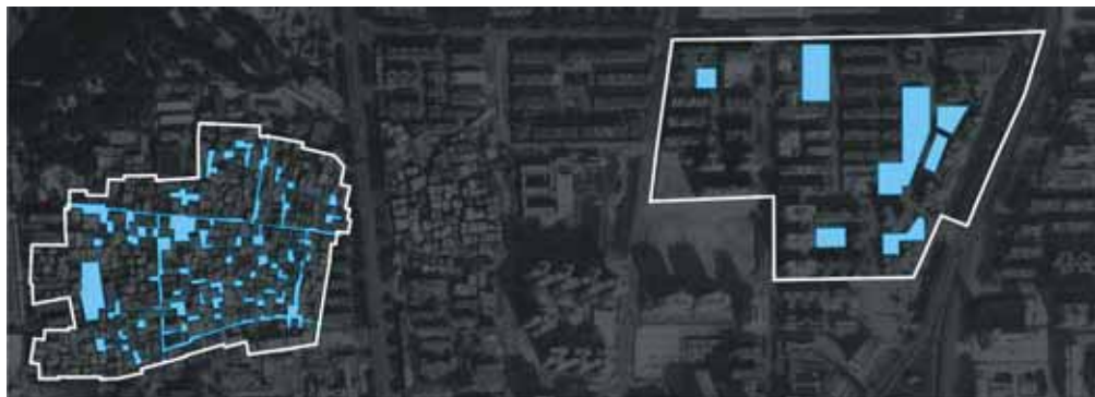
Fig. 10 comparison of connection of public space in urban village and new housing

Urban Village is the only historically sedimented artifact in the whole urban landscape of Shenzhen. They grew out of original fishing and farming villages. These villages, formed in time, were evolved out of human needs thus made in human scale (Fig. 9). The open space was intricately connected and interwoven, where small allies led to internal courtyards that led to main streets and squares (Fig. 10). The street grid persisted and new extrusions were grafted onto. Although the housing units are quite high and the FAR ratio is even higher, the human scale of the villages is still a positive quality as opposed to the grand design ideologies of the “official” part of Shenzhen (Fig. 11).